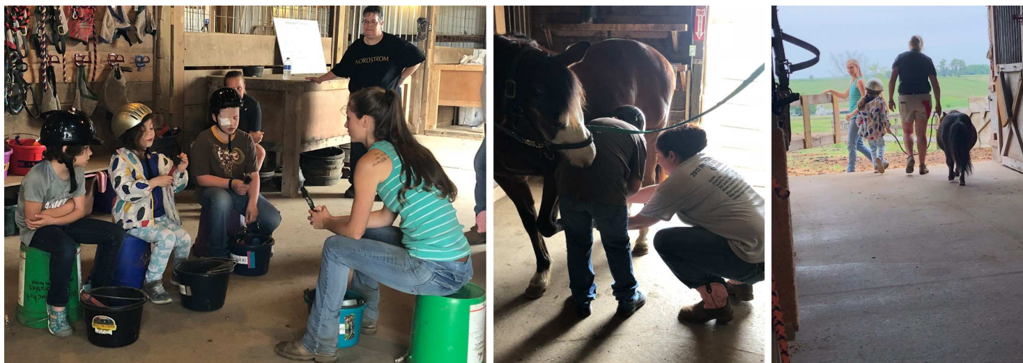
Shots from Horse 101 , our ground program to teach students about caring for and understanding horses.