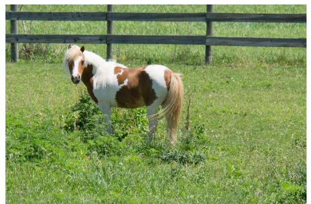
Lucky, a potential new therapy horse at Miracles

All our horses are donated. Being a nonprofit, we just don't have the funds to go out and buy horses when we need them. Consequently, we rely on folks like yourselves to give us a call when you find a horse needs a good home, maybe a young rider has outgrown a horse, or the animal is getting up in years and can't quite work as long as he used to. (continued on the next page)