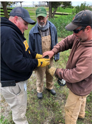
Thanks to South Slope, Hills Bank & Rapids Reproduction for coordinating their work days with preparation for Boo at the Barn!