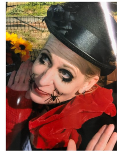
Images from Boo at the Barn More on our website .