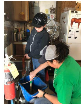
Summer Horse 101 starts