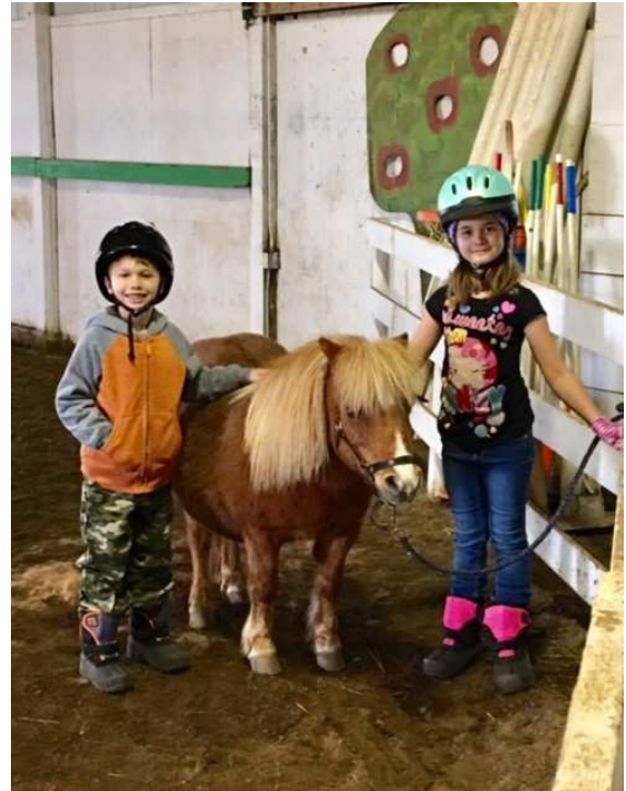
Little Guy helps an MVECS family learn about grooming and leading a horse!