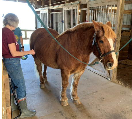
Prepping for trimming