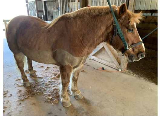
I was patient, now where are my treats!